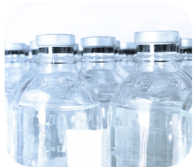
Sentry Managed Batch Record Operations in US and EU